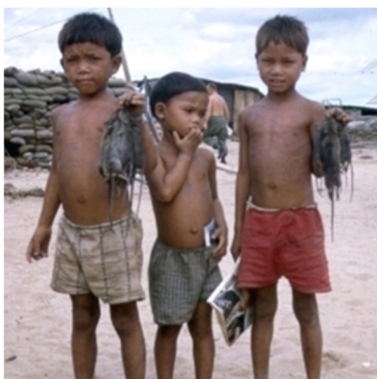
Young rat hunters do their part to provide dinner in Ấp Bắc Chan

The best-looking meat was water buffalo as it was generally roasted meat. It was a tough, coarse meat, but offered a lot of protein. I declined to eat the meat when I suspected that dog meat was presented. It may have been acceptable to Vietnamese, but it was not up to my standards. I was never got that hungry.